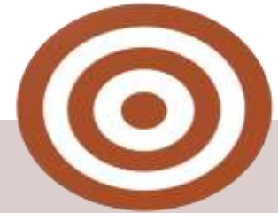
GPS in Smartphones